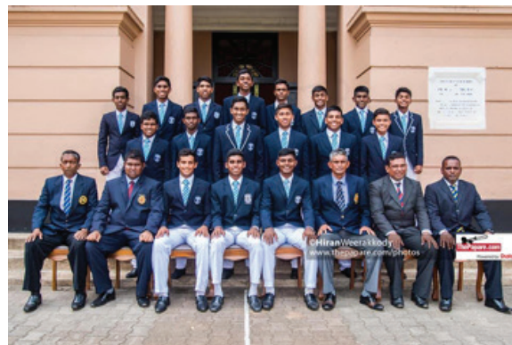
Battle of the Saints - Big-Match